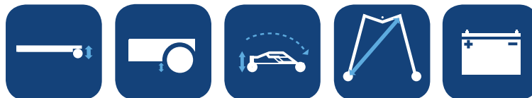
Height of legs ▼ Ground clearance ▼ Height when folded ▼ Turning diameter ▼ *Working ability ▼