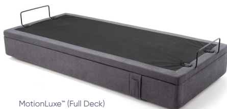
MotionLuxe™ (Full Deck)