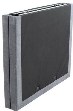
Static / Motion™/MotionPlus™ (Folding Deck)